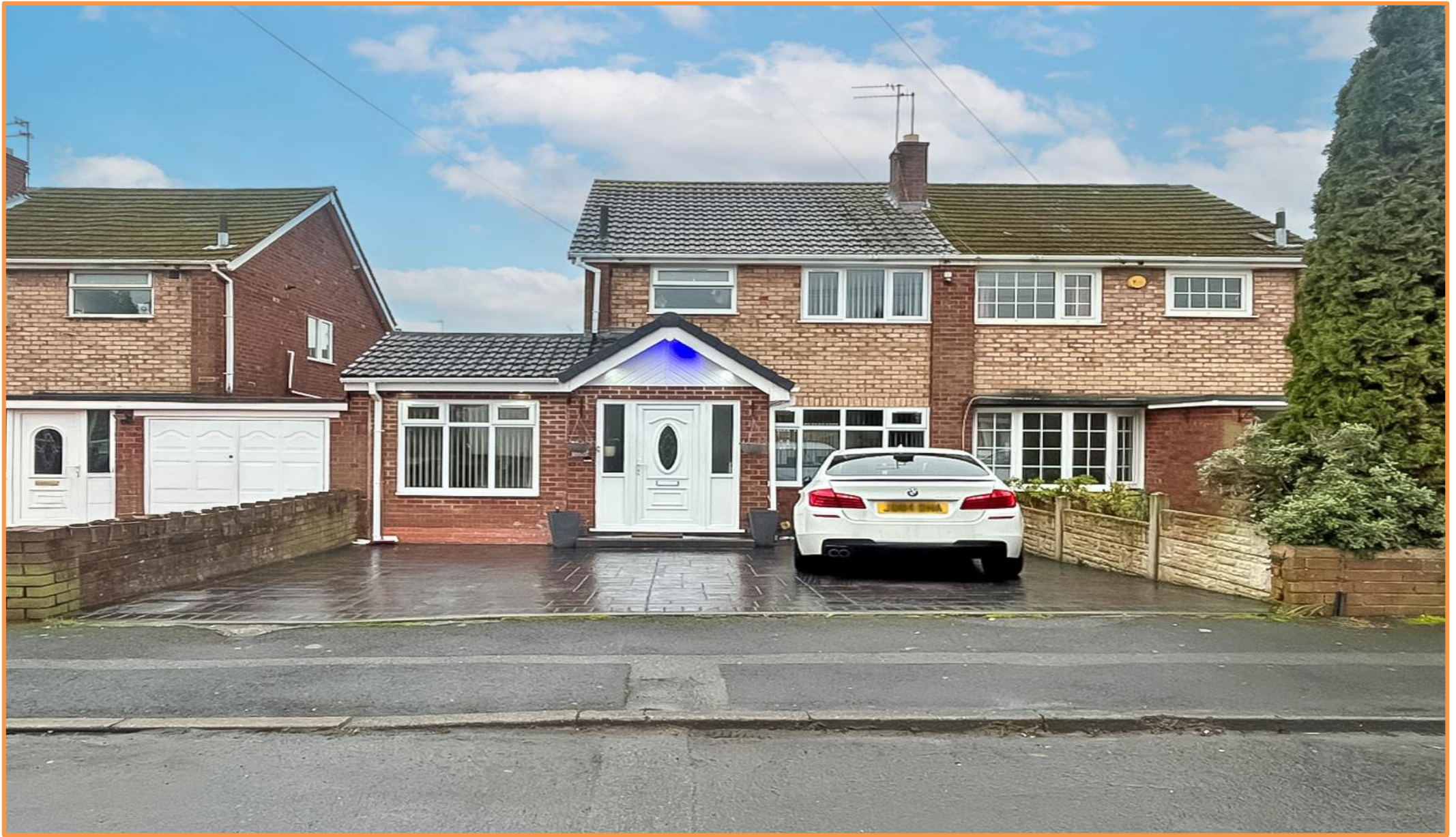
Duke Street, Wednesfield Wolverhampton, WV11 1TH